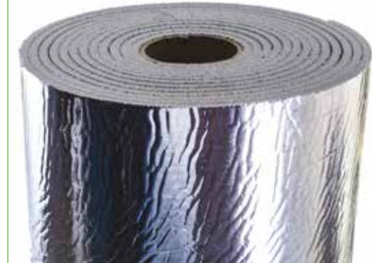
TROCELLEN CL 1 ALU SMOOTH